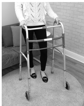
VP129FW Folding Walking Frame (Wheeled)