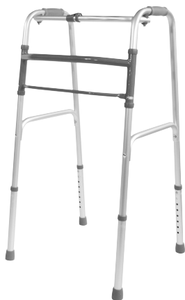
VP129F Folding Walking Frame (Unwheeled)