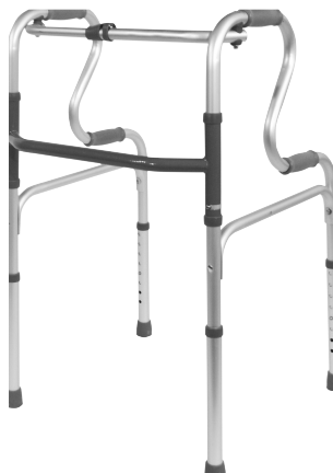
VP179A Dual Riser Folding Walking Frame (Unwheeled)