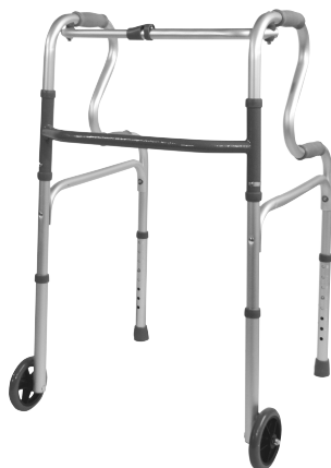
VP179B Dual Riser Folding Walking Frame (Wheeled)

This file is available to view and download as a PDF at www.aidapt.co.uk . Sight impaired customers can use a free PDF Reader (such as adobe.com/reader ) to zoom in and increase the text size for improved readability.